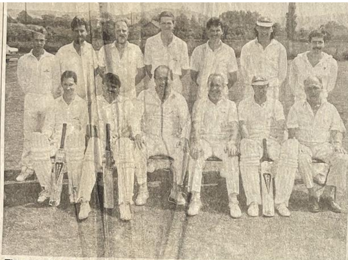
The victorious Bledlow side who have now reached the last 32 in the Rothmans Village Knockout Cup