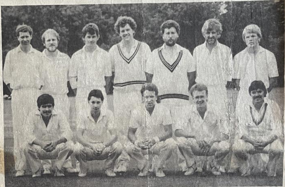
The Bledlow side before Sunday's epic Norsk Hydro match at Langleybury.

emerge winners from a game where cricket was the biggest winner of all, now go to Wales for the semi-final against Ynysygerwn, comfortable winners against Troon in Sunday's quarter final tie.